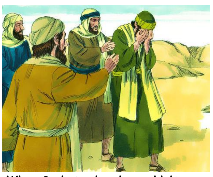
When Saul stood up he couldn't see.