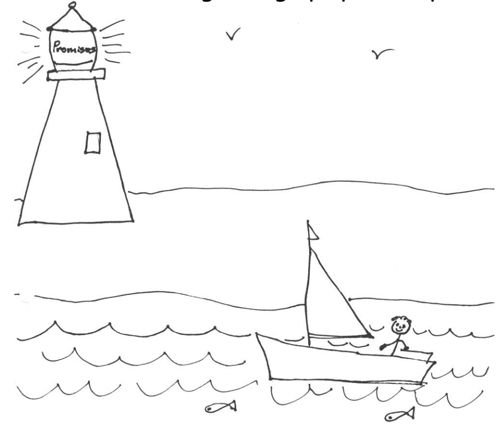
1 Peter 2:1-3 Therefore, rid yourselves of all malice and all deceit, hypocrisy, envy, and slander of every kind. Like newborn babies, crave pure spiritual milk, so that by it you may grow up in your salvation, now that you have tasted that the Lord is good.

As believers, we start out as babies. For our spiritual nourishment or soul food, we have just "milk'. However, we have great "milk". The Holy Spirit teaches us basic facts in the word of God. As we grow, He teaches us more of God's truths. We can put our faith and trust in what God teaches us in His word because God is truth! As we take in this wonderful nourishment, the Holy Spirit will change our point of view to God's point of view. We will be growing up spiritually!