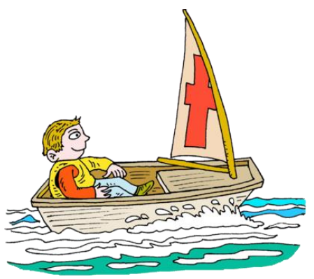
Set sail into the future with Jesus